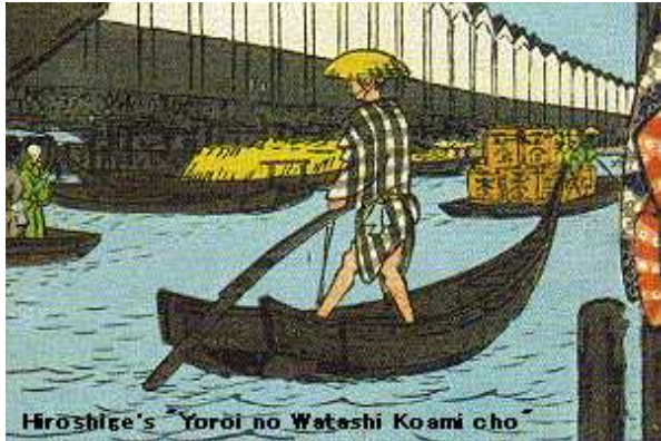
"Yoroi no Watashi Koami cho"(a part.) "

source: "Hiroshige no Oh-Edo Meisho Hyakkei Sampo" (Jimbun-sha 1996)