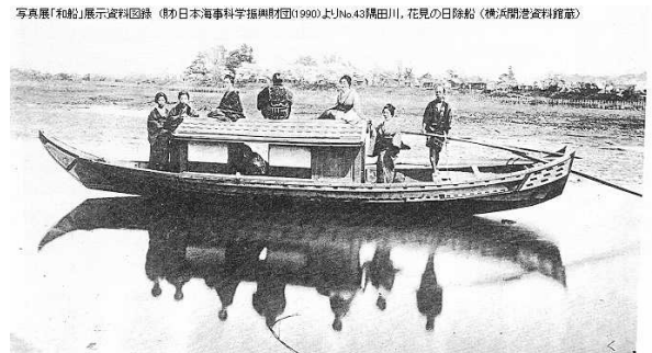
"Hiyoke-bune"; Sunshade (sightseeing) boat on the Sumida river, Tokyo in Meiji Period.