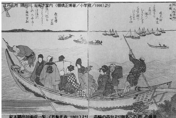
Just launched by two "Sao"; long poles. but there is a Ro prepared at the stern.