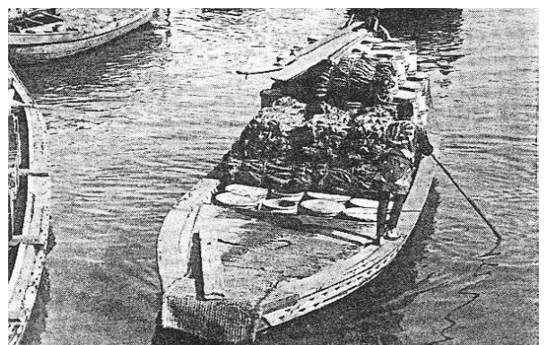
"Sedori-bune"; Transportation boat for shallow area. In the Nihonbashi river, Tokyo. There is a Ro on the top of the boat.